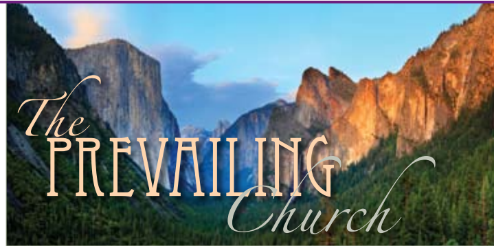
Holy Spirit Conference • August 5-8, 2009