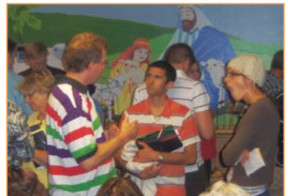
Waiting out the tornado warning in a classroom

The October Bulletin will be posted on our website: LutheranRenewal.org .